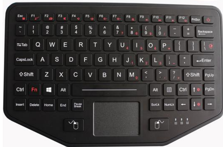
Model NO.: K-TEK-V275TP-FN-BL-SC-WF-FDT