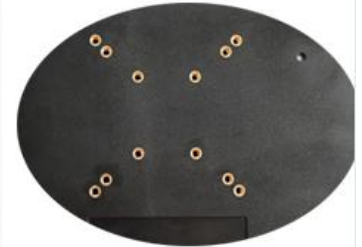
VESA Mounting Holes