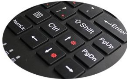
1.20mm long Key with extremely good tactile feeling